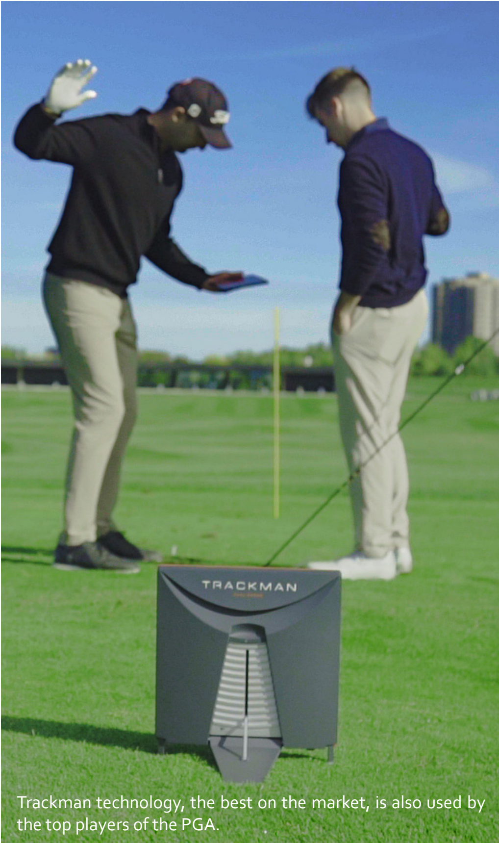
Trackman technology, the best on the market, is also used by the top players of the PGA.